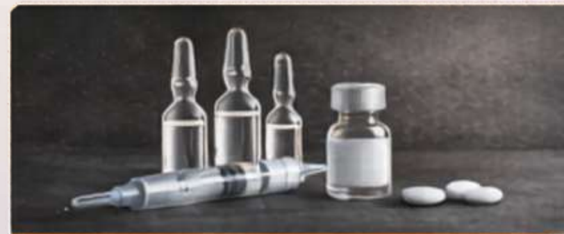
Critical Care Injectables